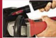
Dust shroud can be easily mounted to the MILWAUKEE® M-Class cleaners with unique „click-system“ adaptor