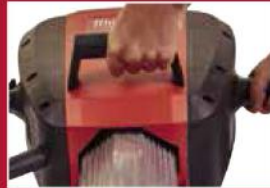
Additional third handle