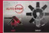
AUTOSTOP™ - maximum control, advanced safety