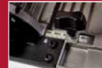
Double fence is anchored at the front and the back of the saw