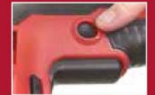
Safety clutch protects user if drill bit jams