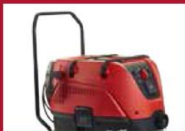
Trolley handle for convenient transportation onto the job site