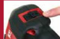
Trigger lock on for chiseling