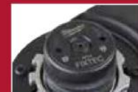
FIXTEC™ flange nut