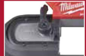
Tool-free blade locking mechanism for quick and easy saw blade changes