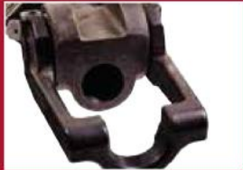
28 mm Hex reception for chisels with and without ring