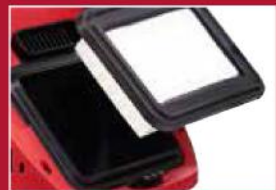
Durable PTFE filter