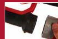
Additional handle for weight distribution