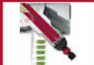
Micro mitre adjustment for accurate mitre cuts