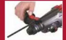
Soft grip main side handle