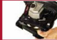
Magnetic, tool-free interface