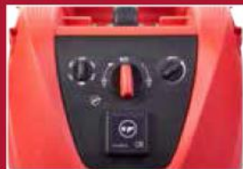
Power take off for auto switching of powertools