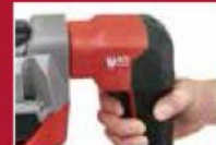
Large AVS back and side handle minimises vibration exposure