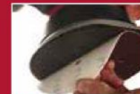
Hook and loop change system