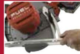
Tool-free cutting depth adjustment and plunge lever for fast and effective plunge cuts