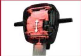
Floating body anti-vibration technologies