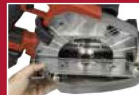
Large metal chip collector captures debris produced while cutting and provides needed visibility