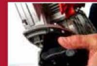
60° bevel capacity