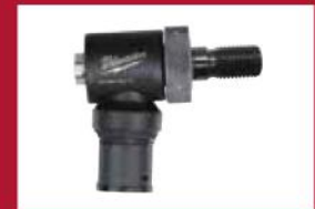
FIXTEC™ Cleanline rotor (additional accessory) the best solution for dust extraction