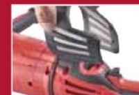
Removable dust screen