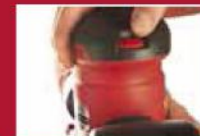
Variable speed selection (4000-10,000 rpm)