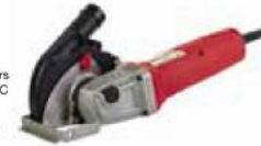
AGV 12-125 X DEC-SET