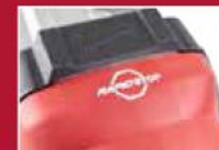
RAPIDSTOP™ braking system