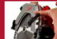
Sprung loaded riving knife