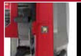
Performance light indicates when the device is pushed to hard