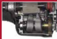
Counter balance mechanism ensures low vibrations - 12.5 m/s 2