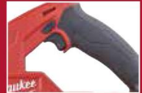
Variable speed trigger for quick & easy speed adjustments