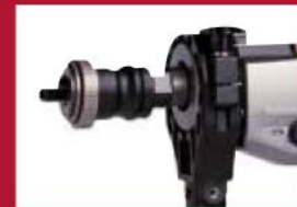
M16 FIXTEC™ adaptor for fast core bit changing