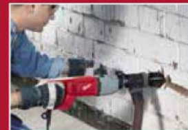
Safe handling from the long AVS side handle and „D-shaped“ back handle